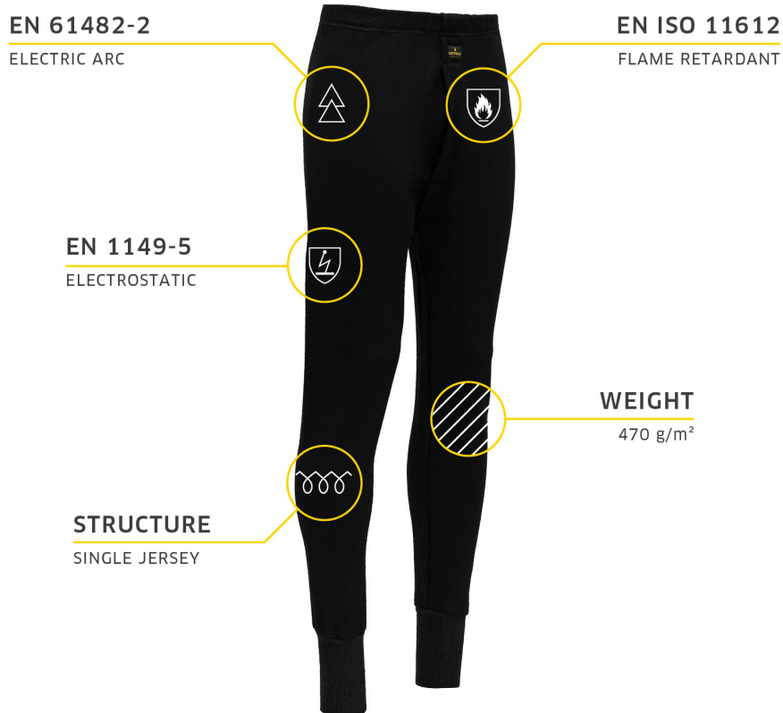
THERMAL long johns - GP 277 100 A 950A

DEVOLD® THERMAL - made from 98 % pure new wool and 2% Nega-stat®. The wool provides good protection against cold, radiant heat and flames, while the Nega-Stat® provides an optimal antistatic protection. With Devold® Thermal, you keep warm even at rest, since wool can absorb significant amounts of moisture without feeling wet. Devold® Thermal is user-friendly with side panels, and thumb loops to maximize protection and isolation. Wool does not melt, and Devold® Thermal is Zirpro treated to give extra flame retardant properties.