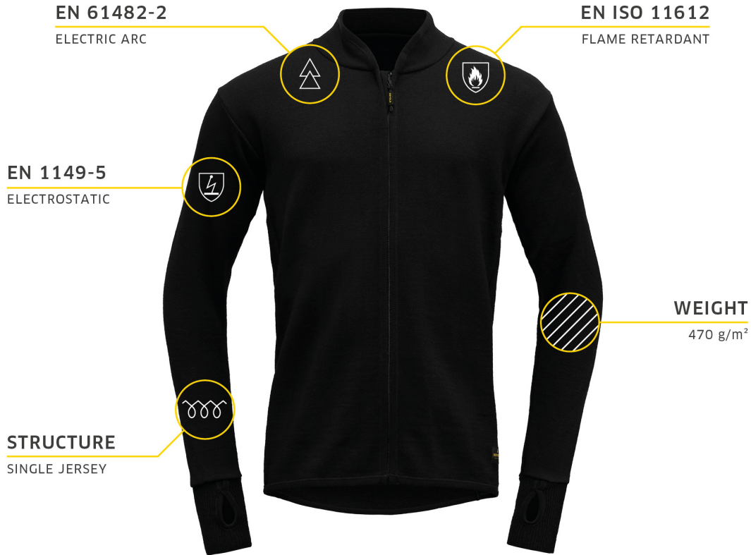
THERMAL jacket - GP 277 251 A 950A

DEVOLD® THERMAL - made from 98 % pure new wool and 2% Nega-stat®. The wool provides good protection against cold, radiant heat and flames, while the Nega-Stat® provides an optimal antistatic protection. With Devold® Thermal, you keep warm even at rest, since wool can absorb significant amounts of moisture without feeling wet. Devold® Thermal is user-friendly with side panels, and thumb loops to maximize protection and isolation. Wool does not melt, and Devold® Thermal is Zirpro treated to give extra flame retardant properties.