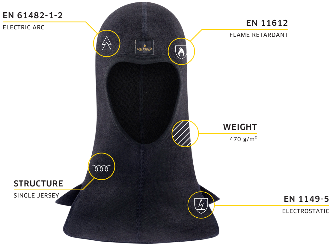
THERMAL balaclava - GP 277 910 A 950A

DEVOLD® THERMAL - made from 98 % pure new wool and 2% Nega-stat®. The wool provides good protection against cold, radiant heat and flames, while the Nega-Stat® provides an optimal antistatic protection. With Devold® Thermal, you keep warm even at rest, since wool can absorb significant amounts of moisture without feeling wet. Devold® Thermal is user-friendly with side panels, and thumb loops to maximize protection and isolation. Wool does not melt, and Devold® Thermal is Zirpro treated to give extra flame retardant properties.