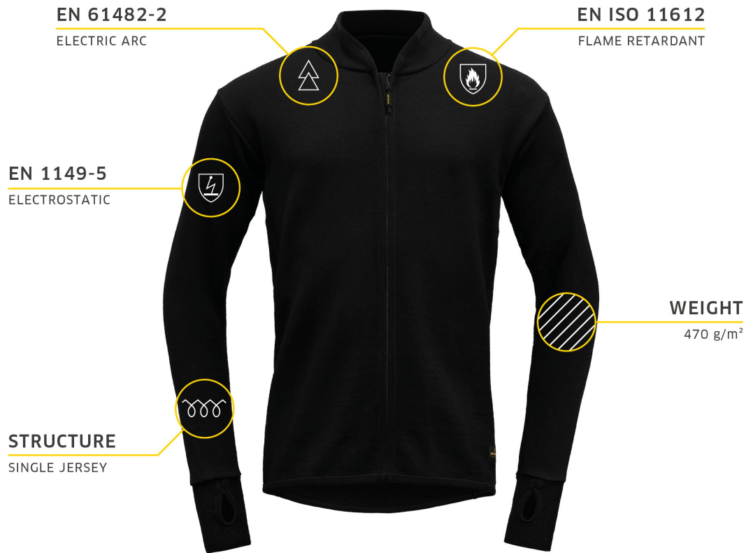
THERMAL W/NEGA-STAT® jacket - GP 277 251 A 950A

DEVOLD® THERMAL W/NEGA-STAT® - made from 98 % pure new wool and 2% Nega-stat®. The wool provides good protection against cold, radiant heat and flames, while the Nega-Stat® provides and optimal antistatic protection. With Devold® Thermal, you keep warm even at rest, since wool can absorb significant amounts of moisture without feeling wet. Devold® Thermal is user-friendly with side panels, and thumb loops to maximize protection and isolation. Wool does not melt, and Devold® Thermal is Zirpro treated to give extra flame retardant properties.